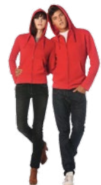
B&C Hooded Full Zip /women & /men